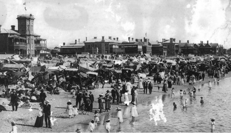
South Esplanade, looking South East, c. 1900 PH-GL-0096

By the mid-1880s, the sand dunes of Glenelg's esplanade had long given way to the summer residences of the prominent and wealthy of South Australia. Previously known as Albert Parade, and then Seawall, South Esplanade was once a promenade of magnificent Victorian mansions and summer gardens. With time, these mansions slowly began to occupy land beyond the dunes morphing Glenelg's streets into a suburb of character and charm.