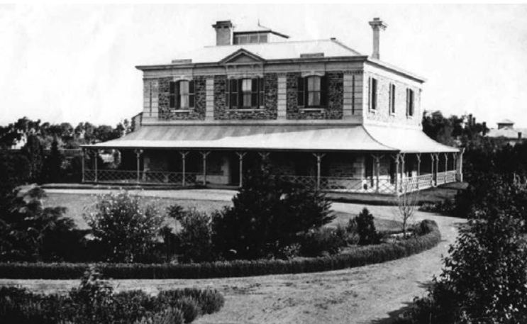
The Olives, 1880 PH-GL-0245