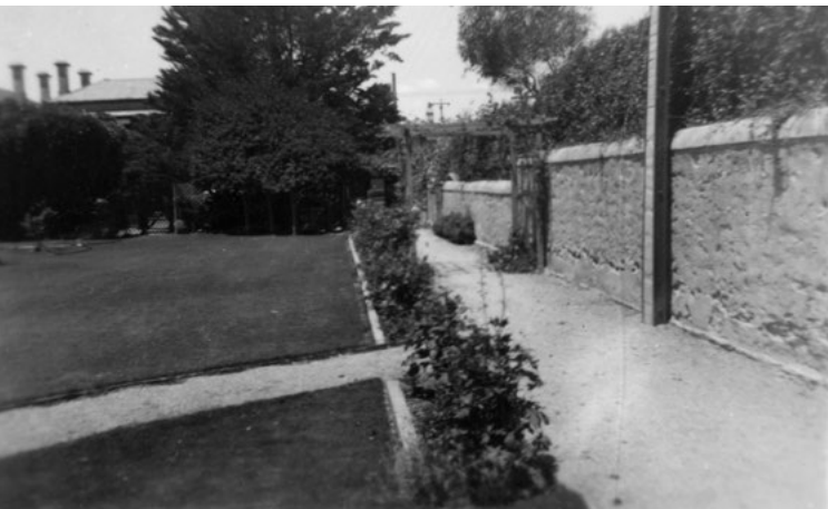
Melrose summer garden abutting St John's Row, 1948