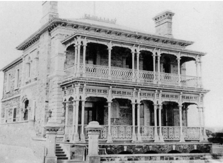
Albert Hall, 1878 PH-GL-0262