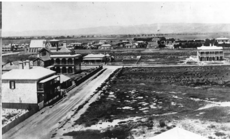
Hindmarsh House (bottom left corner), College Street looking East in 1878 PH-GL-1235