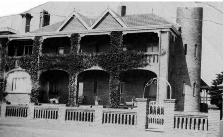
Melrose, c. 1948