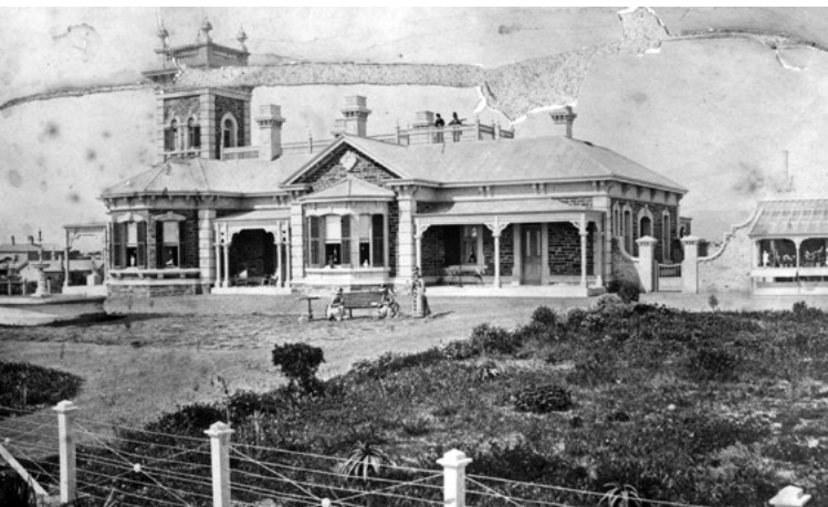
Glenara, 1875 PHGS-0034

Glenara is one of Glenelg's stately treasures. It was built for William Hill and was owned by his descendants until 1990. A fine example of Italianate architecture, it has an imposing central, flag topped tower which accentuates its castle-like appearance. It was designed by architect Thomas English, as a 6-room house. Two front rooms, the tower, a widow's walk (as seen in photograph but since removed) and a conservatory were added at a later date. A widow's walk is a railed rooftop with a good vantage point of the sea, popular in 19 th century coastal houses. The name is said to come from the wives of mariners, who would watch for their spouses' return, often in vain.