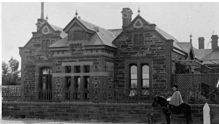
Waterworth, c. 1888