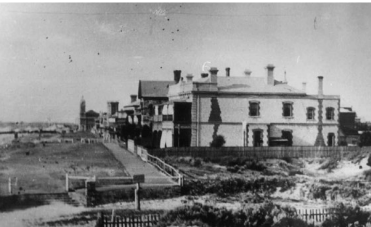
Seawall, South Esplanade, looking North toward Moseley Square in 1892