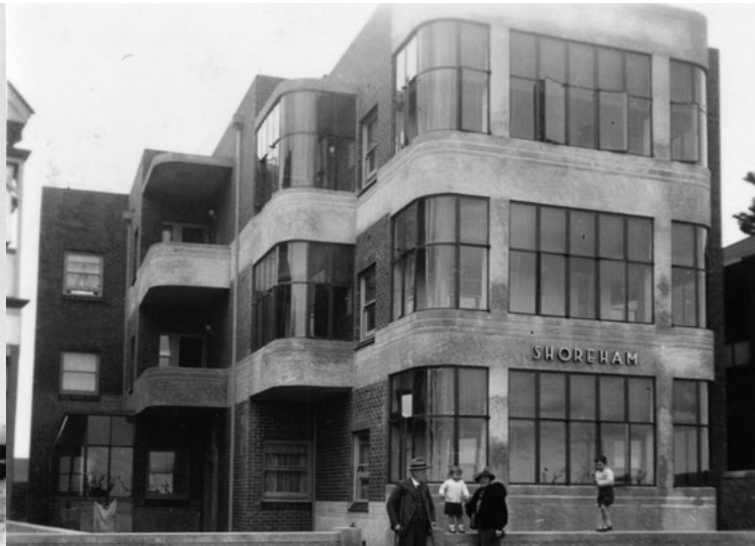
Shoreham Apartments, 1939