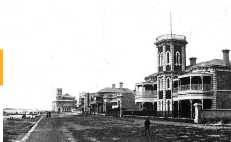
Seafield Tower, South Esplanade, looking North toward Moseley Square in 1875 PH-GL-1169

State Heritage listed Seafield Tower was the first of its kind built along the esplanade. It was designed as two self-contained, 15 room summer residences for Sir Henry Ayers and Sir Thomas Elder, when both were in their late fifties. Ayers made his fortune from the Burra Copper Mines that secured the wealth and future of the colony of South Australia. Uluru - Ayers Rock in the Northern Territory is named in his honour. Elder was a pastoralist, businessman, philanthropist and politician. Ayers inhabited the northern side and Elder the southern. Each residence had a separate staircase to the tower, but the landing was communal.