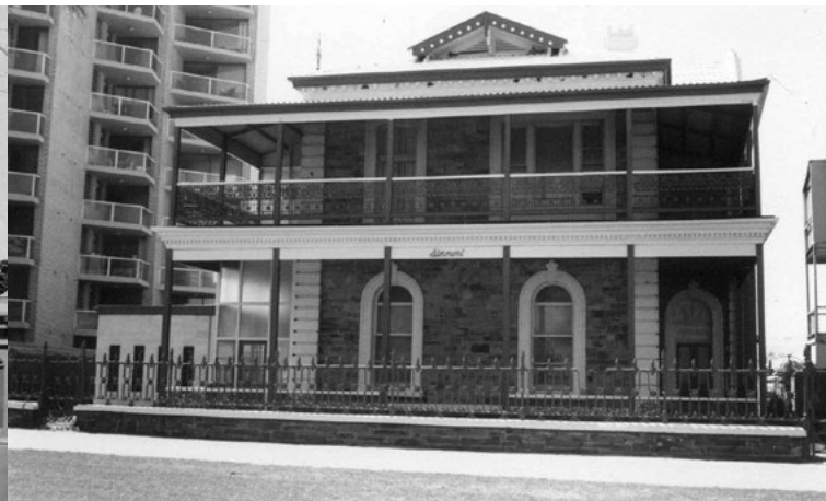
Stormont, 1986 PH-GL0281