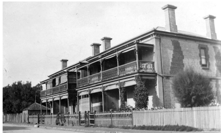
St John's Row Terraces, c. 1900 PH-GL-1399