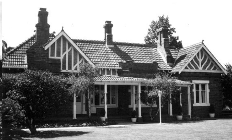
Partridge House, 1971 PH-GL-0313

On 10 April 1973, Glenelg Council purchased the property saving it from demolition. Today the City of Holdfast Bay hires out the house to community groups and for private functions. The gardens are open to the public daily and feature the Townsend Drinking Fountain, gifted to Council in 1877.