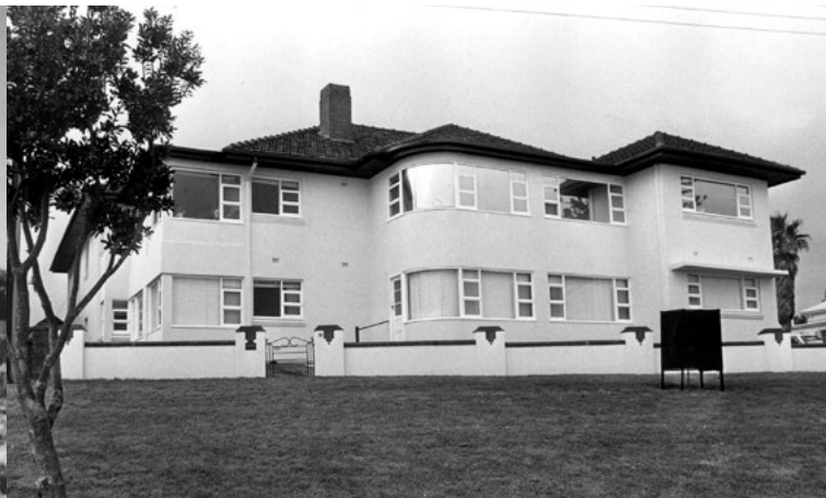
Raleigh Flats, 1987 PH-GS-0013